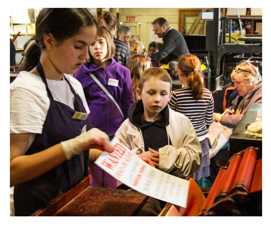
Isana printing a 'WANTED' poster.